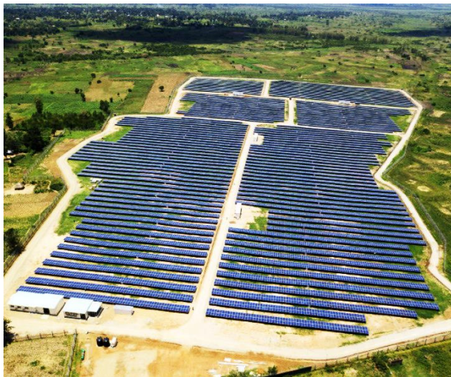
Figure 2. Utility-Scale Solar Plant in East Africa.