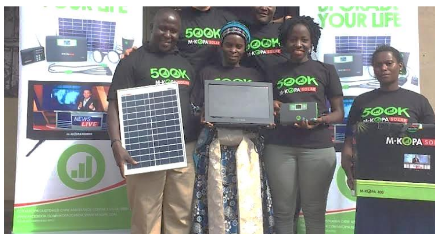
Figure 1. M-KOPA Solar Pay-As-You-Go Model.

Through this platform, M-KOPA raised over $2 million, which was used to provide affordable solar home systems to over 150,000 households in Kenya (Figure 1). This model has proven effective in providing capital for small-scale, decentralized energy solutions that traditional banks may view as too risky [5].