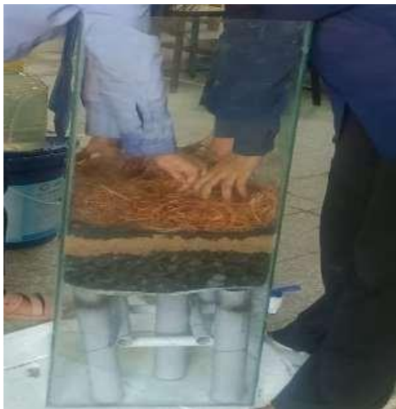
Figure 2. Quantity of material in filter media processing.