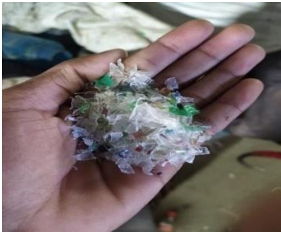
Figure 2. Manually cut plastic waste pieces ready for mixing in brick production.

The plastic waste is sorted into small pieces after the batching process. Caps made of plastic are cut with scissors. The cut plastic pieces are kept at a size of between 2 mm to 3 mm so that they can mix well (Figure 2).