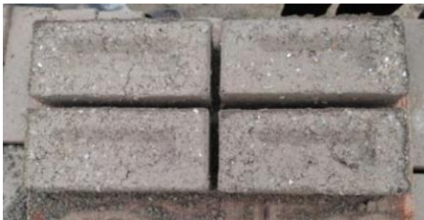
Figure 5. Plastic bricks after 28 days of curing, prepared for strength testing.