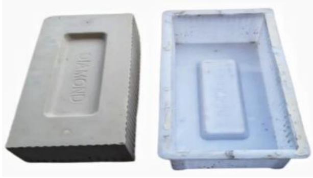
Figure 4. Brick mold used for shaping the prepared plastic–cement mixture.

Once the right mixture has been attained, the mixture is poured into the necessary mold. The use of standard brick molds in this project is with the size of 19 x 9 x 9 cm. After two days, the bricks are taken out of the mold and then left to be cured (Figure 4).